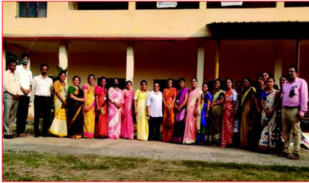
DIERTs from Dakshina Kannada