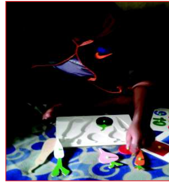
Prajwal solving jigsaw puzzles.