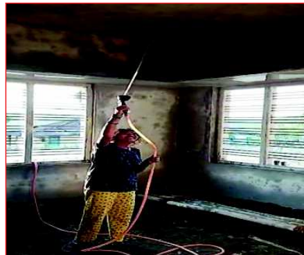
Drishya – Curing the Concrete