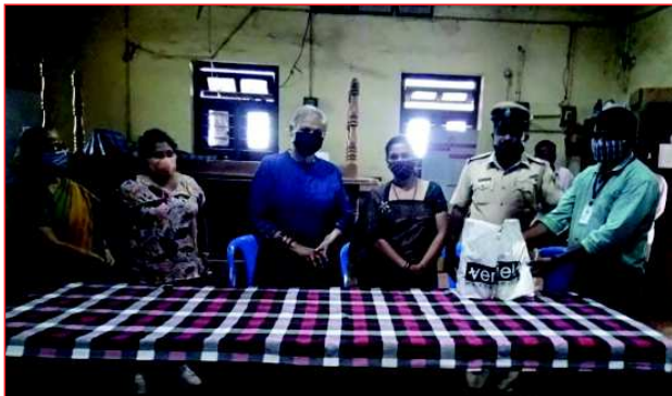
Provisions distributed at Sidapur. Committee members with the Police & Gram Panchayat