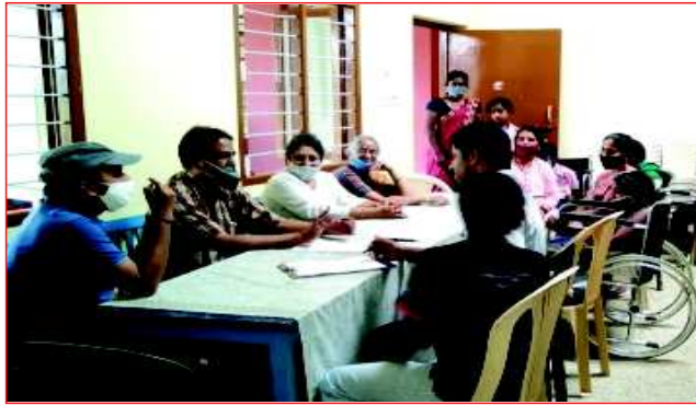
Performance audit Meeting with parents