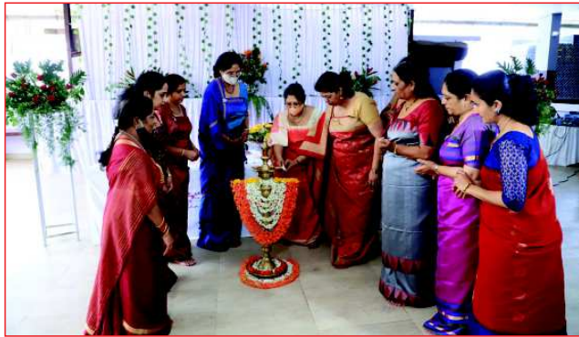
Women's Day celebration at Ammathi Kodava Samaj