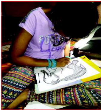
Drishya - Colouring.