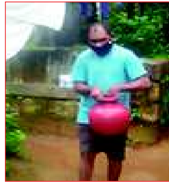
Thangacha carrying water