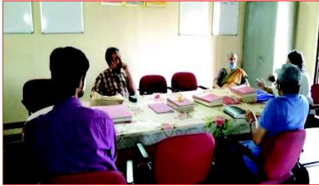
Performance audit by Senior Audit Officer from Office of the Principal Accountant General (Audit I), Karnataka, Bengaluru