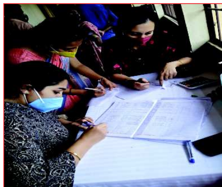
Volunteers of CHIC at work