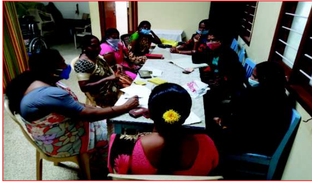
Parents Kannika Self Help Group Meeting