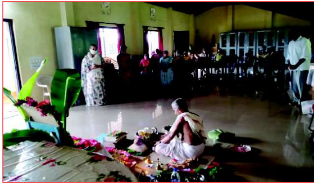
Annual Sharadha Pooja