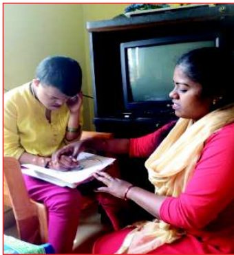
Saraswathi learning to write and colour