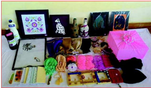
Variety of our Products