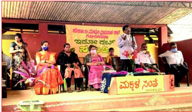
“Makkala Santhe” held at the Gonikoppal GMP School