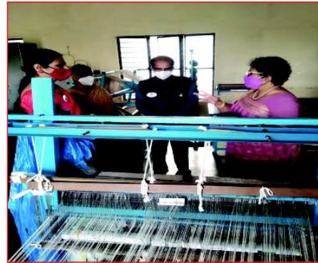
Lions Governor's Visit to inaugurate the Rain water harvesting project by Lion's Club of Gonikoppal