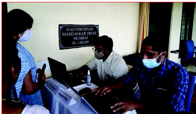
The CHC Computer Operators