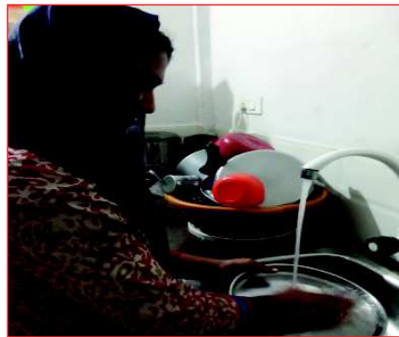
Nishana washing plates