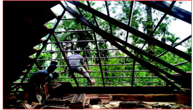
Sathish working with contractors