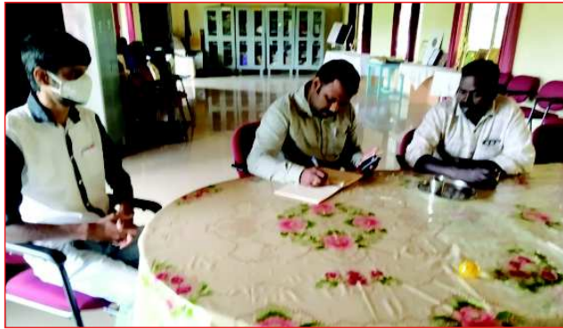
Junior Engineer's visit