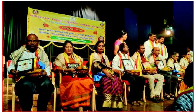
The Chair Person gets the Kannada Vikas Ratna Award for her work for the welfare of Children with Disability from the Karnataka State Vokkaligara Vikas Sangha at Mysore on the 19 th December 2020.