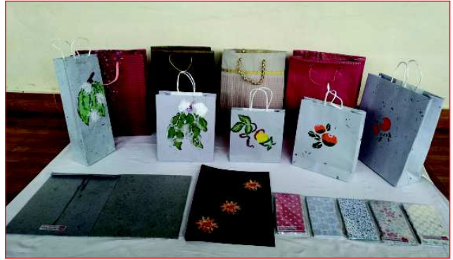
Hand Made Paper Products