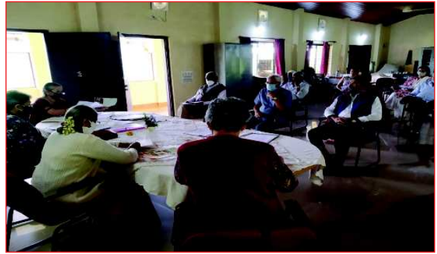
Last Year's Annual General Meeting AGM of CHIC