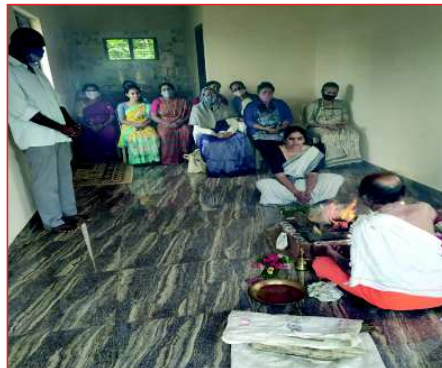
Pooja for the new Staff Quarters