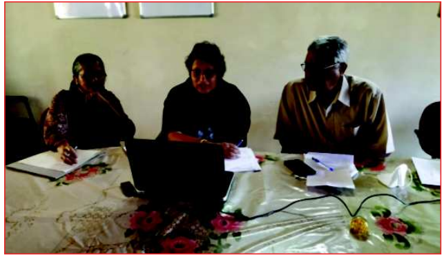
Zoom Meeting with Ikikai Lifestyle Ltd