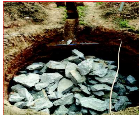
Rain water harvesting project