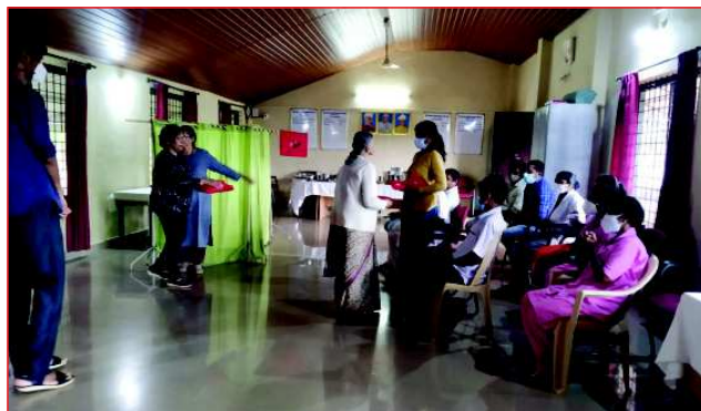
Covid Warriors being honoured for their work