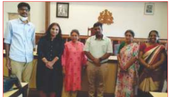
Meeting Of 5 NGO's With The Deputy Commissioner & DDWO