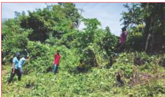
Dominoes Kala & Kreedha, Yuvajana Sangha do Shramadhaan