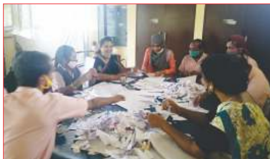
At the HMP unit