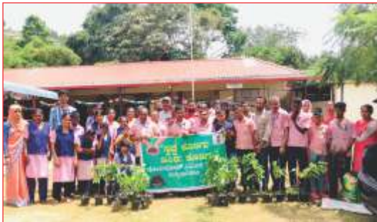
“Clean Coorg Green Coorg” Environment Day By Dominoes Youth Association