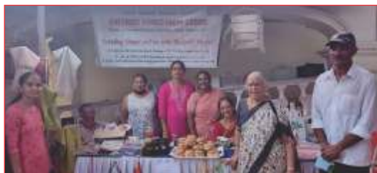
Stall at Bamboo Club