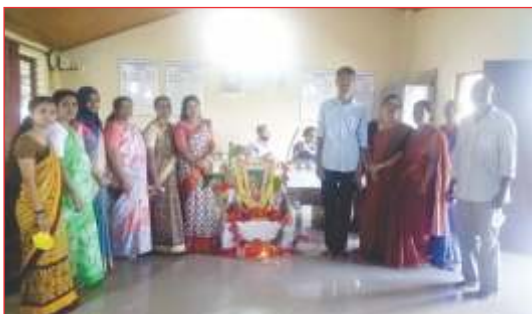
Sharadha Pooja and Ayudha Pooja