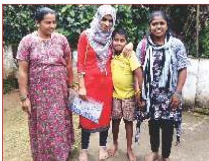
Home Visit To Likith