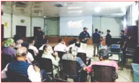
"Bheerya" the Kodava movie celebrated its 50th day of success