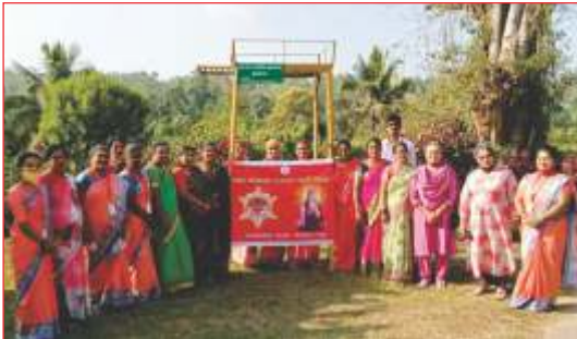
"Veerashaiva Lingayath Mahila Sanghatana vedike" donated a water tank stand