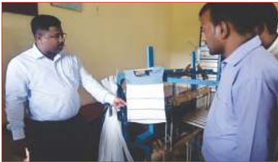
Visit To The Plastic Loom Unit