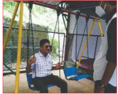
Inspection By The Deputy Director Of Women & Child Welfare