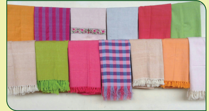
Pure cotton handloom towels woven