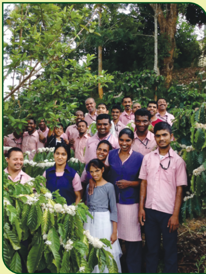
Amongst the Coffee Blossom In our Coffee block