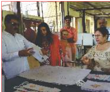
At The Handmade Paper Unit