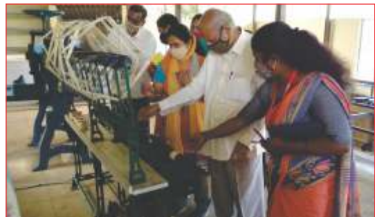
At The Bobbin Rewinding Machine