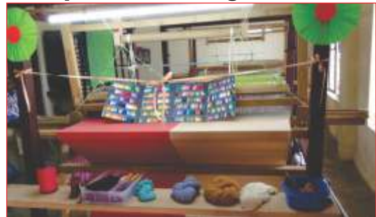
Accessories Used In The Loom