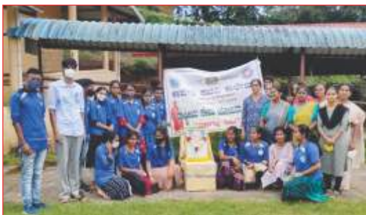
NSS Students from Cauvery College Gonikoppal