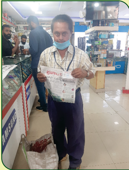
Vishu distributing newspapers in Gonikoppal