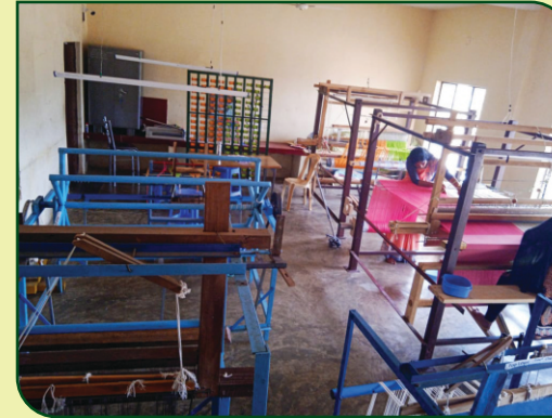
The handloom weaving unit