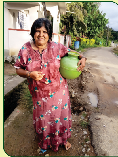
Mahdevi helping at home