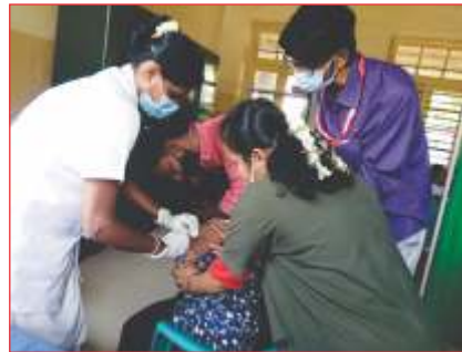
The 1st dose Vaccination