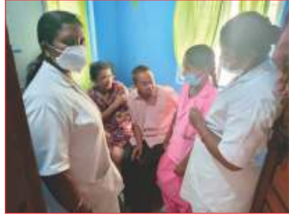
Medical Team Visit to Rohini's