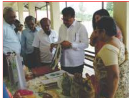
Sahaya Products on Display