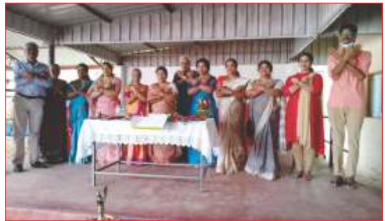
Breaking the Bias