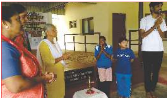
International Yoga Day was celebrated