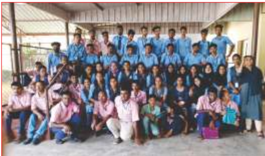
Political Science Department of Government First Grade College, Virajpet.