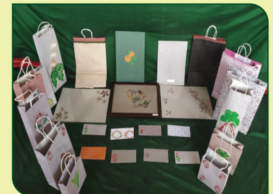
handmade paper products

Programme Vision : To make a difference in the lives of Persons with Disability (PWDs), Women and the Community Organizational Vision : To extend services as a Resource Agency in the District. Mission : To create a conducive environment and empower Persons with Disability, women and their families