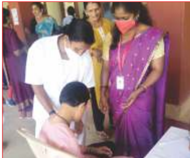
2nd dose vaccination