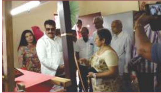
Inauguration of Looms