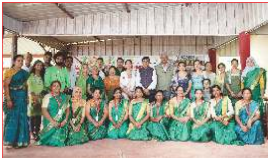
“Save Soil” Event