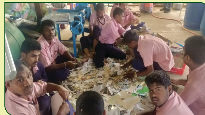
The severe shred the paper