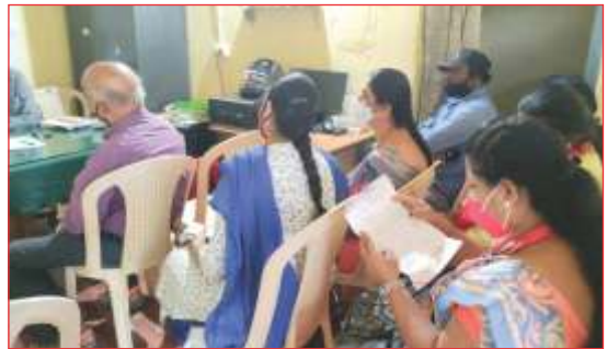
Awareness of Electricity Services at TATA Coffee, Pollibetta.