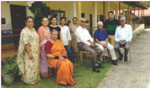
The Committee Members & Volunteers