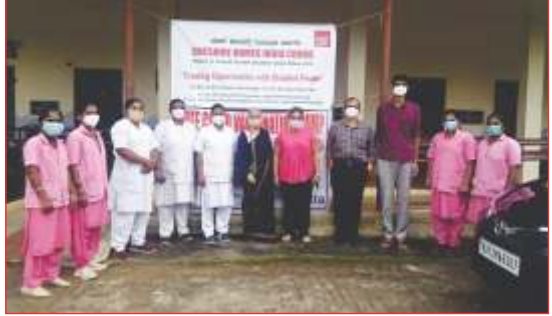
The second vaccination camp