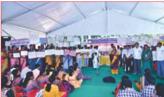
Special educators from across Karnataka staged a one day strike