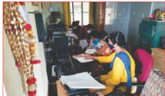
Saree tassel and Embroidery Online Training