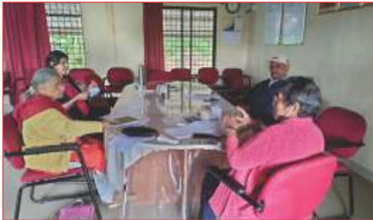
A meeting for the construction of an additional building at our Centre