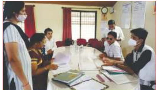
The Deputy Director & District Disabled Welfare Officer Visit