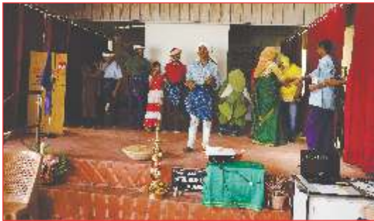
“Save Soil” Event