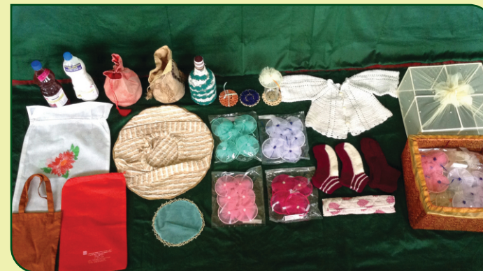
Various products manufactured