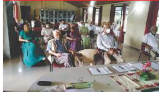
The AGM of CHIC was held