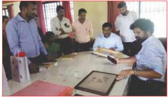
The Assistant Commissioner of Kodagu, the Tahsildar, Revenue inspector, Pollibetta Panchayat P.D.O, & Other Officials Visit