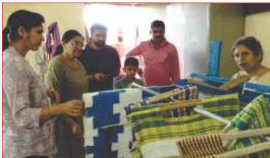
Plastic Woven & Upcycled