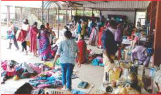
Jumble Sale at our Centre