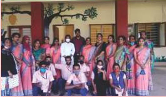
Nutrition Health check by Coorg Institute of Dental Sciences