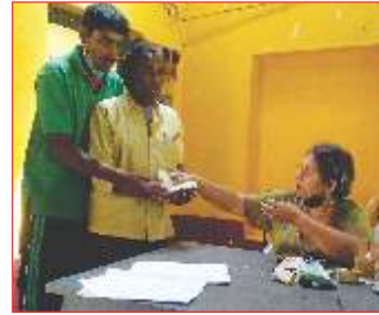
Money was distributed among the 7 members of the Spoorthy Sahana Self-Help group From Their Savings