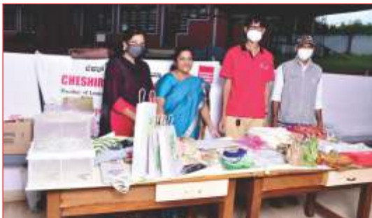
Stall at the Lions Clubs International Regional Meet - held at Ammathi