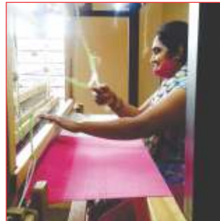
Weaving the towels