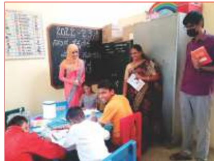
District Disabled Welfare Officer's Inspection