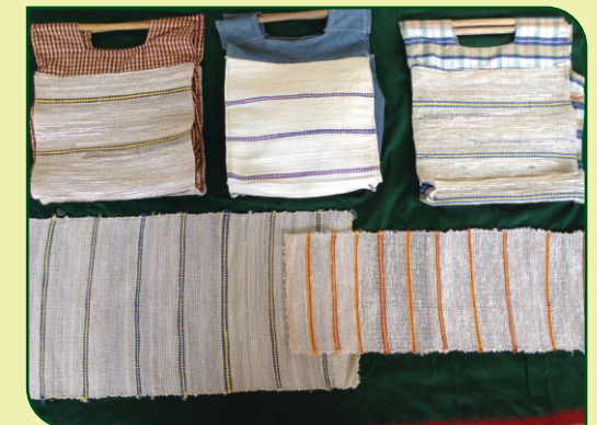
Plastic woven and up cycled