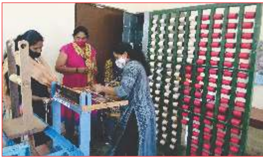
Bobbins for Warping