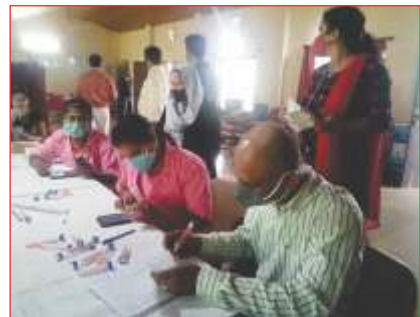
With Primary Health Centre Team – Chennayankote